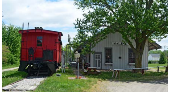
Photo: Saline Depot

Development of both automobiles and the trucking industry reduced travel by train and trolley. Rail passenger service to Saline was discontinued in the late 1930s; freight service hung on until the early 1960s.